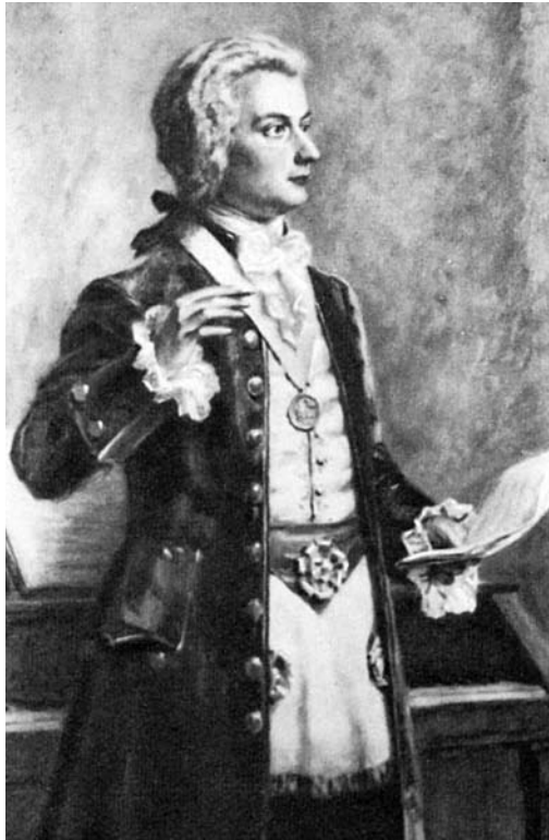
Mozart as a Mason from Kuëss/Scheichelbauer, 200 Jahre Freimaurerei in Österreich (200 Years Freemasonry in Austria), Vienna: O. Kerry, 1959.

Grand concert tours through Europe followed in the years 1763 to 1766.