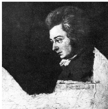
Unfinished painting of Mozart by his Brother-in-Law, Joseph Lange, Ca. 1798–90 where the composer was to be seated at his keyboard, is considered by Constanze to be the best likeness of her husband

Much more could be said about Mozart, the man, the composer, the Freemason, and in this brief essay his accomplishments as one of, if not THE, greatest composer have been purposely omitted. Suffice it to say that during