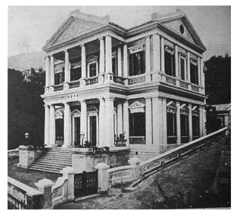
Zetland Hall, on Zetland Street in Hong Kong, was the home of Zetland Lodge No. 525, EC. Built in 1865, it was destroyed by a bomb during WWII. (Icy1846HU)

Sussex who was then the Grand Master in London, later moved to Guangzhou, then on to Shanghai and returned to