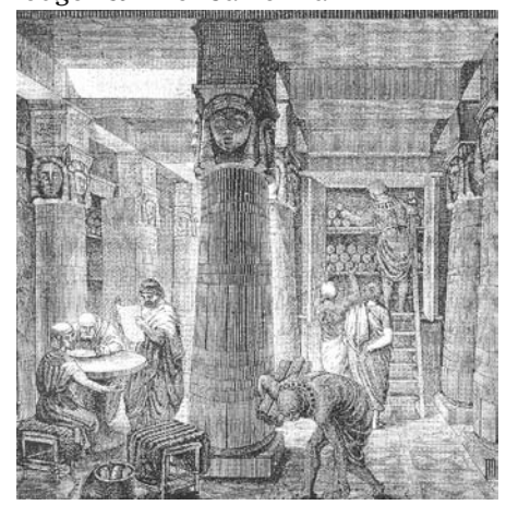
A 19th century engraving of "The Great Library of Alexandria" by O.Von Corven whose rendering is partly based on archeological evidence.

We commonly interpret this passage as referring to great buildings of antiquity, an interpretation encouraged by the reference to the Temple of Solomon. However it is equally likely that the authors of