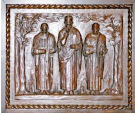
Carving on a Master's Chair at the Detroit Masonic Temple depicts (1 to r) Hiram Abiff, King Solomon and Hiram King of Tyre.

And King Solomon sent and fetched Hiram out of Tyre.