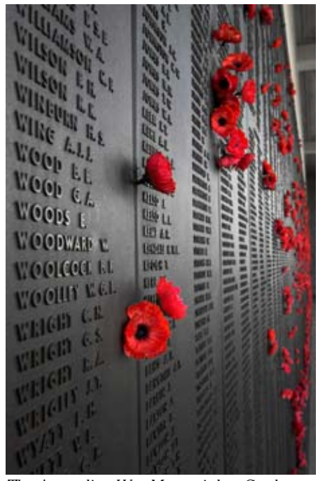
The Australian War Memorial at Canberra where visitors place poppies next to the names of the fallen. See Flanders Poppies , page 2.