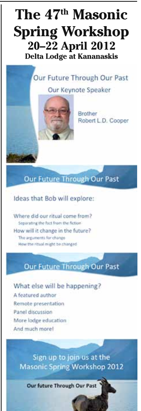
Register early and save. For details on the program, surf the website at: www.masonicspringworkshop.ab.ca

will truly understand why we were told that it is "more honourable than the Star or Garter, or any distinction that can be conferred..." If worthily worn, it is most certainly "an emblem of innocence, and the badge of a Mason..." But it is more. Above all our symbols, it is the only one that we continually wear with "honour to the Fraternity" as well as "pleasure to ourselves."