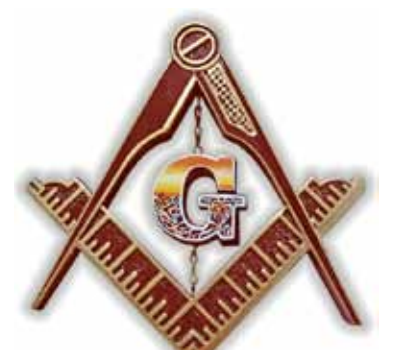
Square and Compasses with a G

*California uses the term "square and compass."