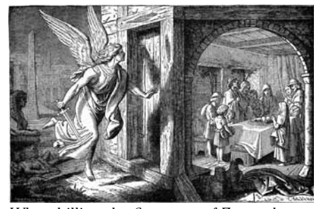
When killing the first sons of Egypt, the Angel of Death "passes over" a Jewish household where the blood of a lamb had been sprinkled on the door. Passover commemorates this event and the resultant freedom from Egyption rule.

In Judaism, the Festival of Passover is celebrated in the spring of the year.