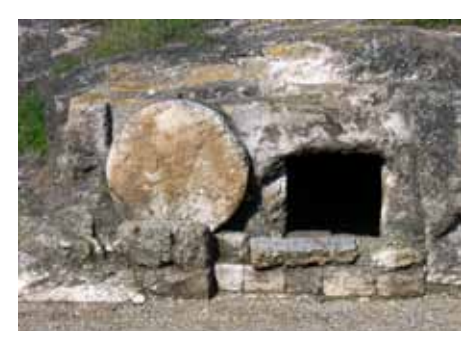
The tomb of Christ? Although it cannot be proven to be so, this is an excellent example of the style of tomb used at the time of Jesus' death.

When Jesus was born, his homeland was occupied by the Roman army. This army was well known for its brutality. There was no room for popular dissent — it was crushed ruthlessly and new ideas were unwelcome. While Jesus was neither a military nor a political