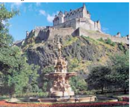
Edinburgh Castle Full itinerary and booking inquiry will be available at website www.myptravel.ca