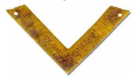
On this Master's Square is written "I will strive to live with love and care"

What come you here to do? To discover myself, and how to rule and use the strange powers within my nature. To improve myself in the Art of Masonry by which the rough Ashlar of youth is wrought into the perfect