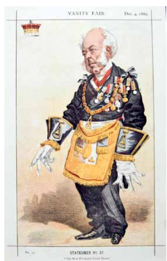
Thomas Dundas (1795–1873), 2nd Earl of Zetland, Grand Master of UGLE, 1844–1870, is depicted in this famous caricture on the cover of Vanity Fair on 4 December 1869. Lodges in Ontario and Hong Kong are named after him. Zetland Lodge in Alberta is named after the Ontario Lodge.

At that moment I learned that valuable lesson that we as Masons should always Meet on the Level, Part on the Square. Our situations and statures in life mean very little when we get to the core of who we are as human beings sharing this big blue ball. Sure, some have the privileged circumstances to lend themselves to the greater good in ways which others may not, but does that make them better people?