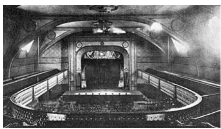
The interior of Hull Opera House, the largest building in Calgary when constructed. It could seat 700 people and was the venue for many cultural events, including the 1904 Canadian premiere of Coleridge's The Atonement