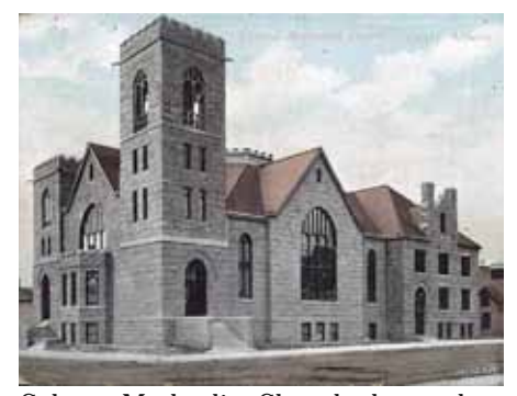
Calgary Methodist Church almost doubled the capacity of Hull Opera House. Postcard by Osborne Bros, 1907.