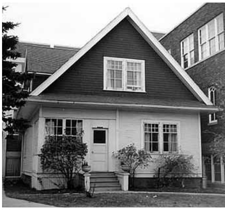
The Kerby Residence stood next to the College.

he turned 80, in July 1940, he said he was still motivated by a "genuine human interest" in his students and a "deep and abiding interest in the welfare and progress of the college." Two years later, he presided over his last graduation ceremony, noting that more than 10,000 students had passed through the college's doors during his 31 years at the helm. "Direct your hearts toward