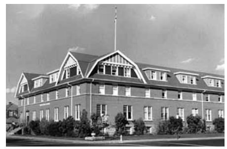
The first Mount Royal College, affectionately known by students as "The Barn," was opened in 1911 at the corner of 7th Avenue and 11th Street SW.

Aprincipal focus also was on religious observance, which didn't sit well with some of the more secular students. "1 didn't like the idea of being forced to