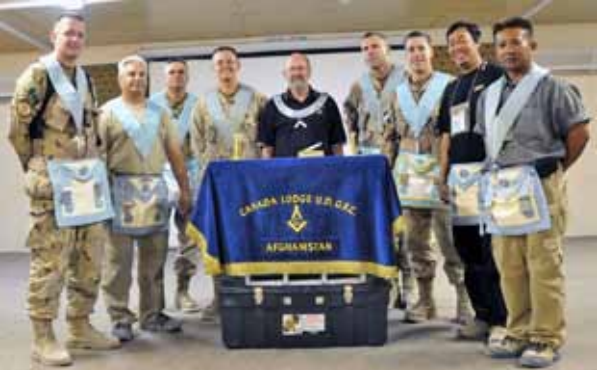
A modern travelling military Lodge — Canada Lodge UD, GRC — was formed by Canadian troops in Afghanistan. Lodge dress is combat fatigues or golf shirt.

In 1743 the Grand Lodge of Scotland issued warrants with the first English (Antients) warrant issued in 1755. From