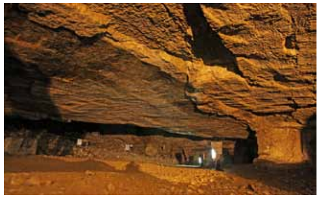
The main chamber of Zedekiah's Cave where Israeli Freemasons hold a communication every year.