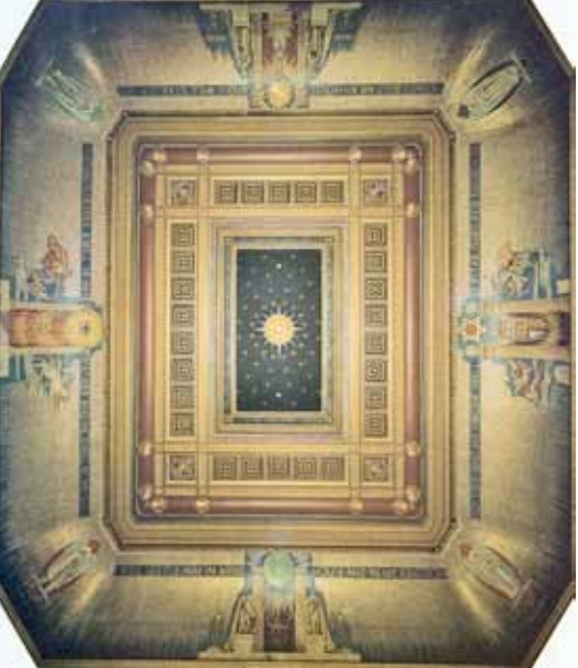
The mosaic ceiling in the Grand Temple at Freemasons' Hall, Great Queen Street, London. (Top is East.)

The group got along very well and we all enjoyed the entire trip.