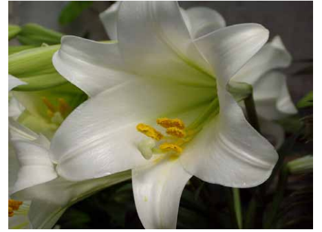
The Lily — a symbol of Easter.

I do however condemn the people who use "God" - Christians or otherwise - as a means of total hatred