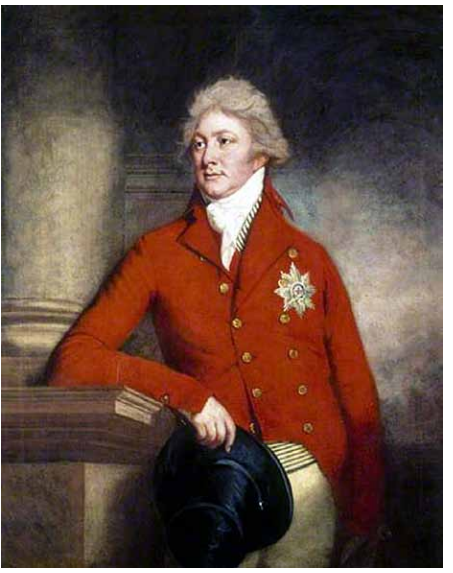
George IV (1762–1830), as Prince of Wales by Thomas Beach, ca 1792, in National Trust Collection.

That Freemasonry is open to men of all levels of American society is something of which we can be proud. American Freemasons don't have many "inferiors in rank or office," nor do we have many, if any, "superiors" as was the case in England in the 18<sup>th</sup> century. What we do have is a Fraternity where we meet upon the level, act by the plumb, and part on the square. That, too, is from our ritual.