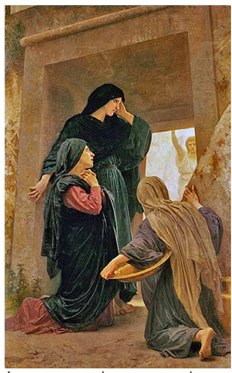
Jesus appears to three women at the tomb on the first day of the week, giving them great joy.

There are many ways we can incorporate the spirit of Easter in our Masonic Brotherhood. Many Lodges have fun events such as crazy tie or casual dress code at meetings, Wild West nights, open-air meetings and so on. We feel less restricted, and probably more aware of the beauty of the universe which our Great Architect created for us. It's also a time we can do more to support our less fortunate Brothers, especially those who are shut-in or who have mobility difficulties. Options may include taking more time to visit our Brothers at their residences, nursing homes or facilities or, if possible, taking them for drives to see places such as where they may have previously lived or enjoyed visiting - something that can allow them to relive precious memories.