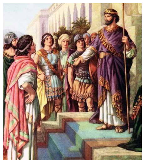
Rehoboam takes the advice of the young

Rehoboam sought the advice of the Elders of Israel, who advised him to rethink the heaviness of the burdens, and to make himself more acceptable to the people. He then also sought the advice of some of the other young people