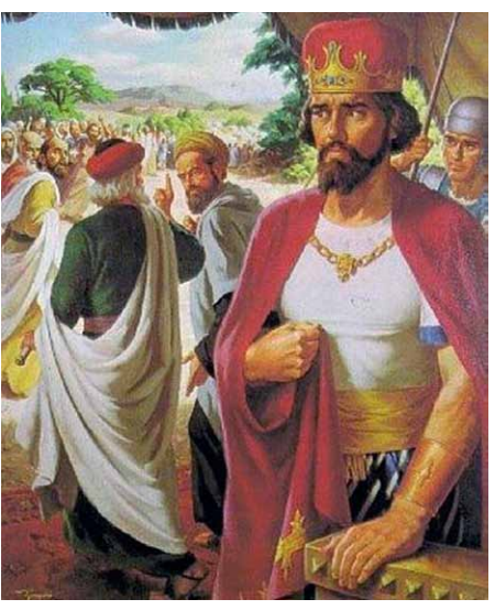
Rehoboam's actions lead to revolt and a splitting of the 12 tribes of Israel.

...an instrument made use of by operative Masons to spread the cement which unites the building into one common mass; but we, as Free and Accepted Masons, are taught to make use of it for the more noble and glorious purpose of spreading the cement of brotherly love and affection; that cement which unites us into one sacred band or society of