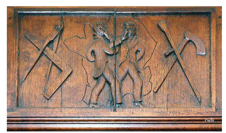
Compagnonnage imagery at the entrance of Musée du Compagnonnage de Tours in France shows the "guilbrette" or rite of fraternal exchange of Compagnons (suggestive, perhaps, of the "five points") along with some of their symbolic tools, some recognizable by Freemasons.

served an organization similar to Freemasonry called the "Compagnonnage." The French title of those who belong to it is "Compagnons du Tour de France." Today the "Tour de France" is a famous bicycle race, but the race was named for a much older institution, a "Tour de France" associated with stonemasons in the Middle Ages. When a journeyman stonemason (a fellow of the craft, as we would call him) wanted to become