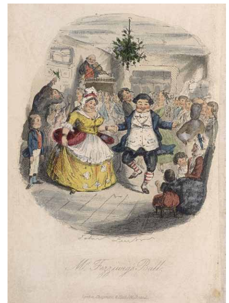
Mr. Fezziwig's Ball — 1843 hand-coloured etching by John Leech (1817–1864), frontispiece of the first edition of A Christmas Carol by Charles Dickens.

We seem to be totally silent on any issues outside of the Lodge. We tend not to develop newsletters, websites, twitter, facebook, and other sources of social media. These topics have met with significant resistance by the older generation, but without them will we dwindle to a vision of the past? Charles Dickens says it well in A Christmas Carol in that Fezziwig ceases to exist because he refuses to adapt to the modern machines of industrialization. So we must adapt in this the modern era of communication and information technology.