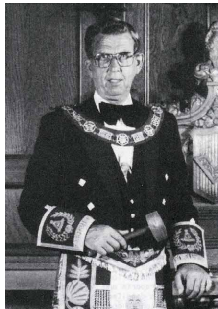
Grand Master of Alberta 1990/1991