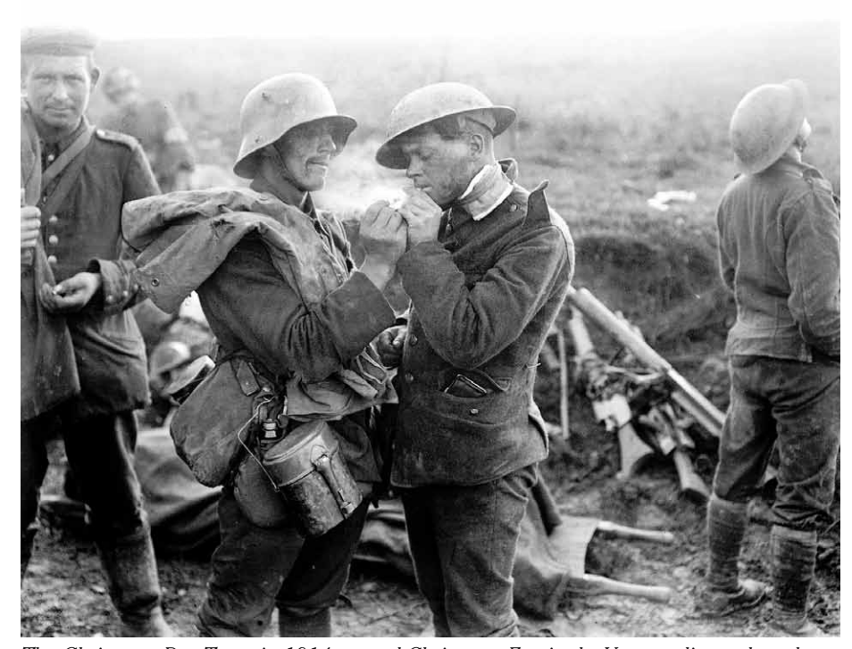
The Christmas Day Truce in 1914 started Christmas Eve in the Ypres salient when the Germans lit candles, decorated a tree in their trench and sang the carol, Stille Nacht (Silent Night). The British responded with carols of their own. The next morning on parts of the front line, soldiers of both sides put down their arms and met in No Man's Land to share smokes and food, and even play soccer.