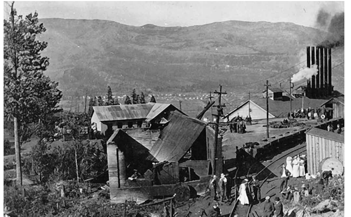
Damage to the hoist house at mine entrance 1. Family and friends gather at the site to await news of their men below. A second entrance is 1.5 km away.