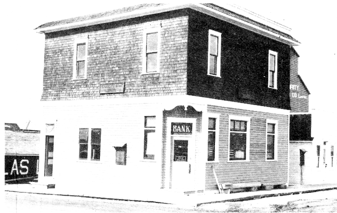
Heritage Park Trader's Bank