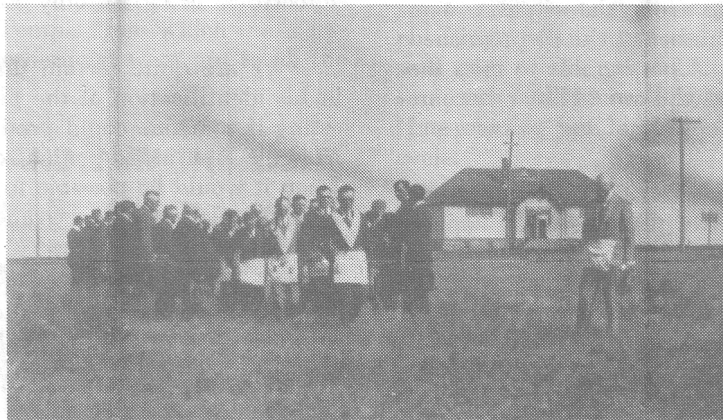
Brethren going to lay the cornerstone