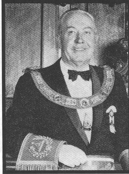
September 13, 1906 — June 22, 1994

He was born in Edmonton on September 13, 1906, the