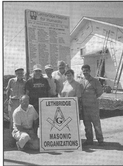
These helping hands wielded paint brushes for someones' "Habitat."

Alpha, Phoenix and Calgary Highwood Districts had a joint presentation at King George Lodge Hall on August 27, 1995 to 13 recipients of Bursaries. The appropriate DDGM of the each District made presentations to these worthy young people.