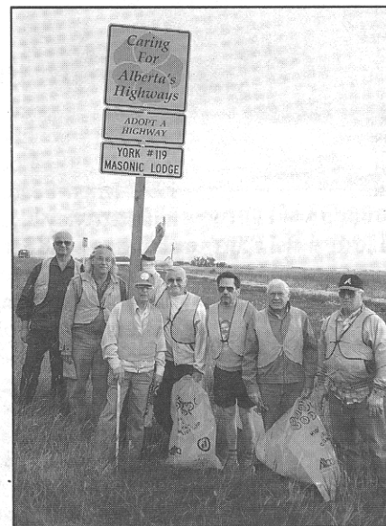
Lethbridge Masons have twigged to a great way to get plenty of fresh air.